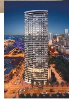
Clockwise from top left: Kids play area at La Baia Bay Harbour; waterfront view of La Baia Bay Harbour; common area at District 225; exterior rendering of District 225; waterfront view of Onda Residences; private penthouse rooftop at Onda Residences.